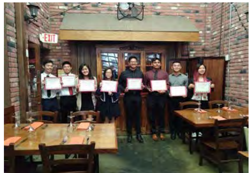
Scholarship winners from 2019 shown. 圖片為2019年獎學金獲獎者

For more info, please contact AAEDE Scholarship Coordinator via: www.aaede.info • aaedeinfo@gmail.com • (626) 572-7021