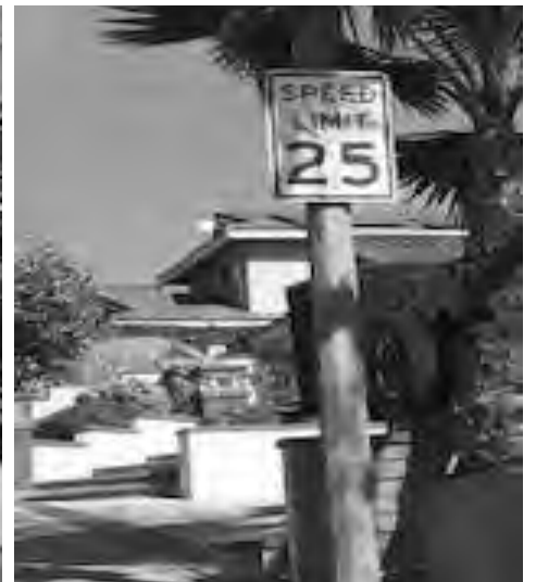
Overgrown Palm Tree encroaching onto the Street Sign.