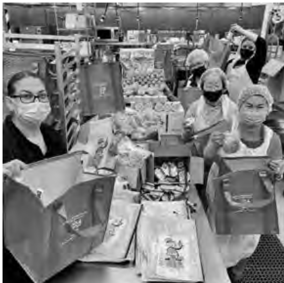
The AUSD food and nutrition services team in the central processing kitchen worked hard to make a fun and appealing sampling kit for the 227 registered participants of the 2022 Virtual Food & Wellness Fair.