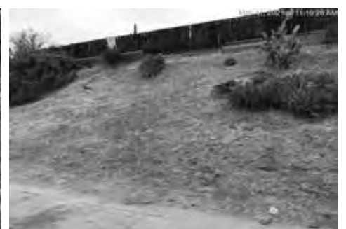
Dry overgrown weeds on the slope.