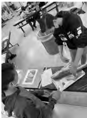
Everyday after-school, Brightwood School's cafeteria is filled with students who are having fun and learning through hands-on activities in a variety of subject areas, including marine biology.

"We are thrilled to offer enrichment classes for our students at Brightwood! These STEM and arts-based classes expand learning beyond the school day in an absorbing and fun way," explains principal Candace Griego. "We hope by offering a variety of topics, students feel they have a say in what they're learning, which supports a positive school climate."