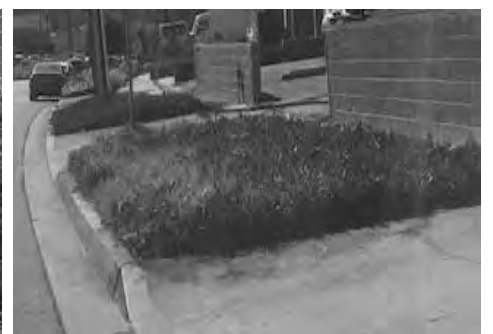
Overgrown vegetation on the parkway encroaching onto the street.