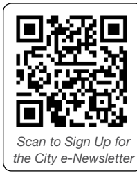
Scan to Sign Up for the City e-Newsletter

To subscribe or for more information, please visit the city website at www.montereypark.ca.gov/ social and look for the social media, e-newsletter, "News" and "Notify Me" links.