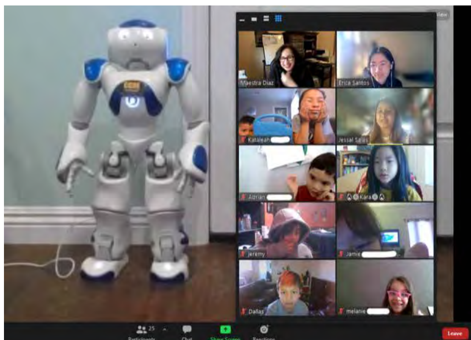
Kimberly Ng's students at Brightwood created a digital thank you card to show their appreciation for Kapono's second visit.